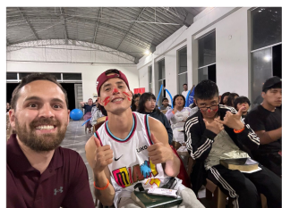
Second Church Plant