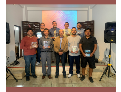
Fathers on Father's Day with their gifts.