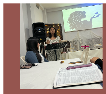
Ladies meeting celebrating Women's Day.